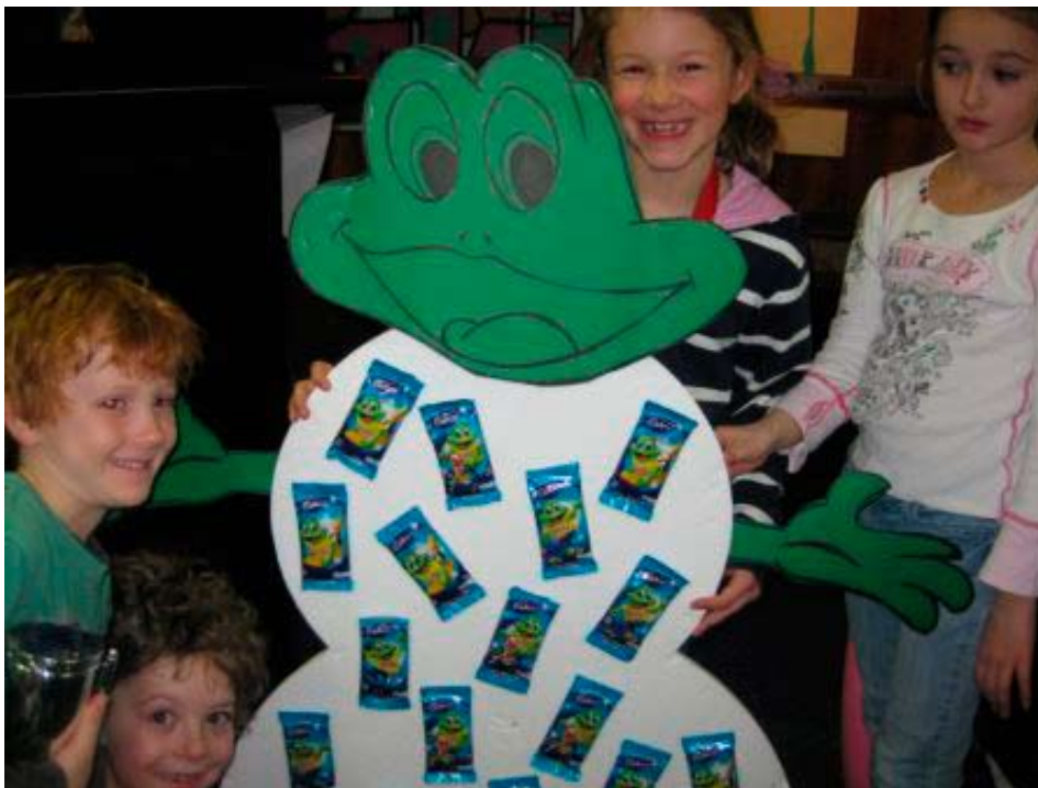
Freddo puts a smile on some little faces!