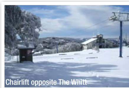
Chairlift opposite The Whitt