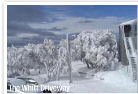
The Whitt Driveway