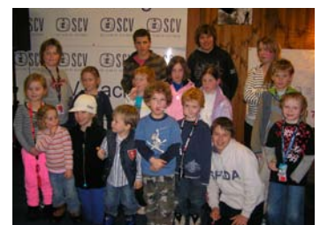
Our skiers of the future!